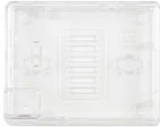
ARDUINO/GENUINO ZERO CASE

( https://store.arduino.cc/product/C000086 )