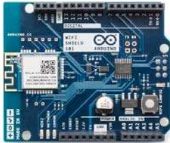
ARDUINO WIFI SHIELD 101